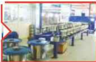
Stainless Steel Fine Wire