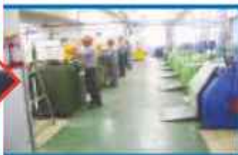
Stainless Steel MIG Wire Lines