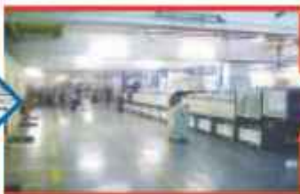
Stainless Steel Wire Drawing Lines